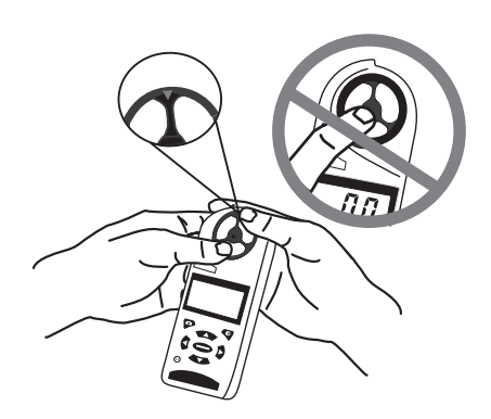
I Figure 1

Orient one "arm" of the module straight up. [I] Figure 2]. The impeller can be pushed in from either side.